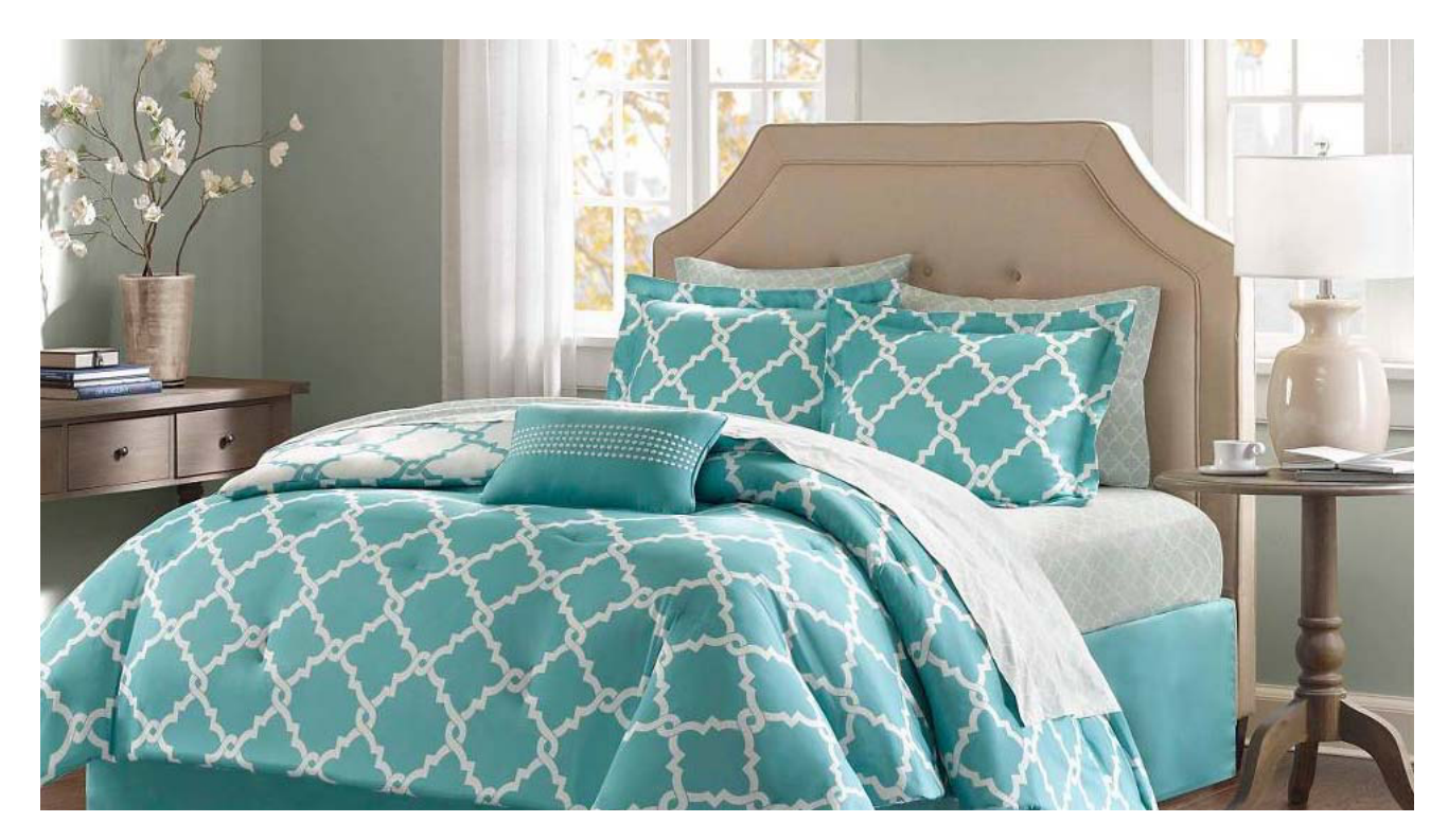
Update the look of a room with a low-cost bedding set. (target.com)

If a bedroom needs updating, snag bed-in-a-bag bedding ensembles from a discount store (starting at as low as $8 at Target). These low-cost linens can even do double duty as a window treatment in a pinch. Jernigan suggests using the matching sheets—that no one will see under the duvet—as curtains.